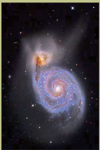
The Whirlpool Galaxy.

Membership is composed of people from all walks of