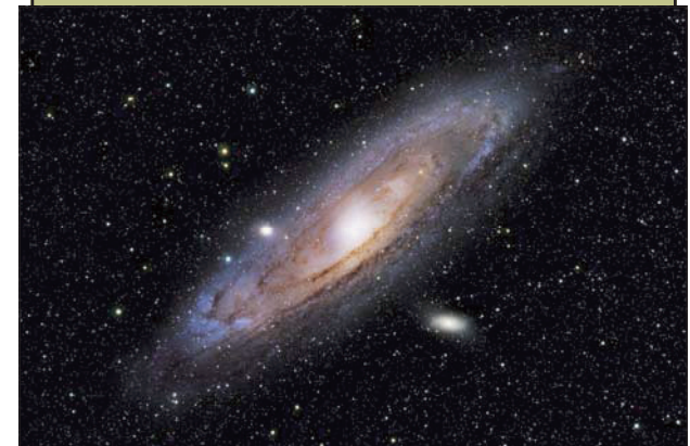
The Andromeda Galaxy (M31).